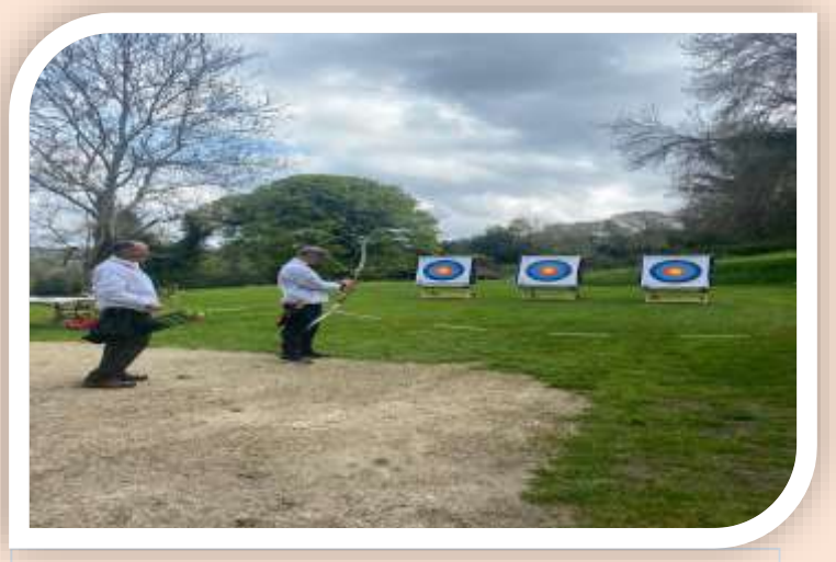
Archery Strike Gold in a Competitive test of skill and accuracy.