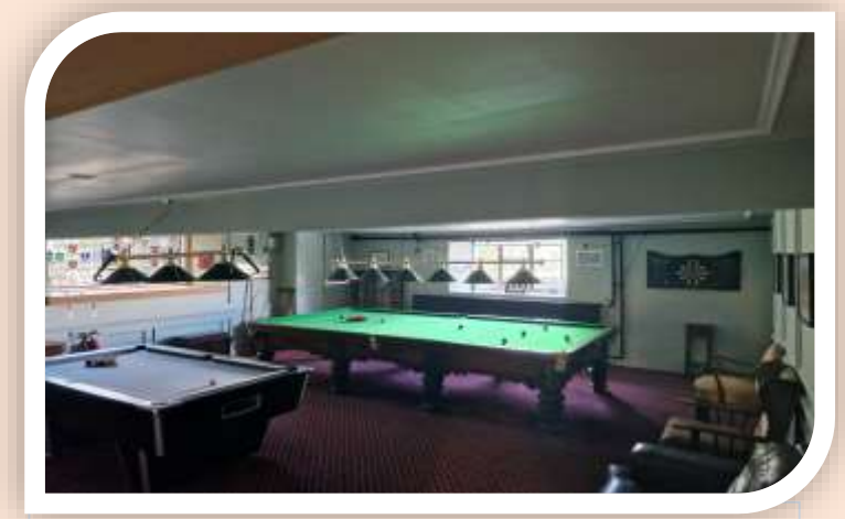
Games Room The perfect underground retreat with pool; snooker, darts I chess.