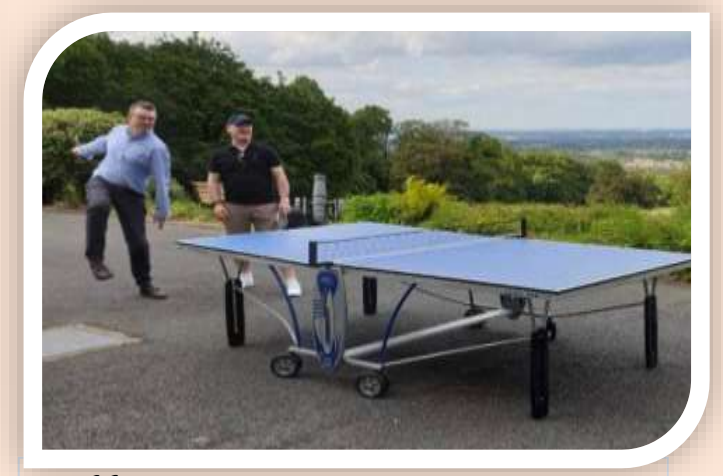
Table Tennis Bring out your competitive streak with a ping pong tournament!