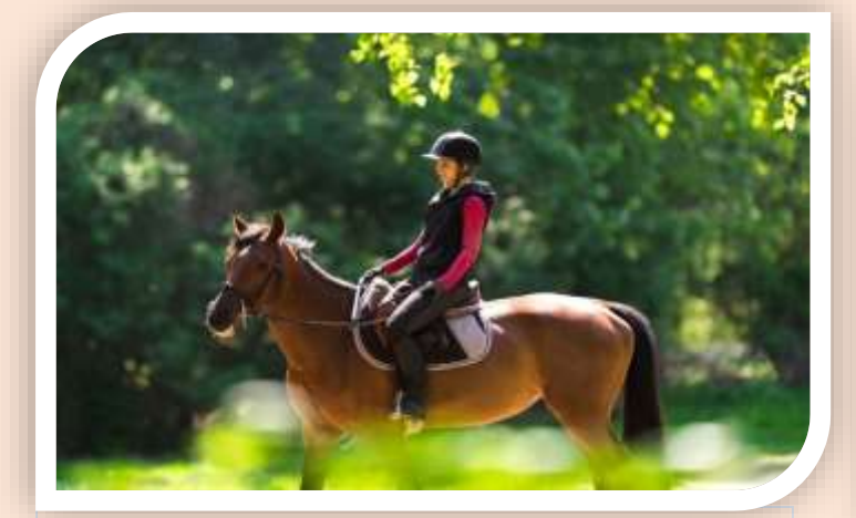
Horse-riding Truly unique experience with Equestrian School located beside Orlagh House who bring the horses to us !