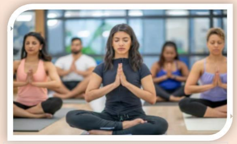
Yoga Yoga can lead to stronger relationships and improved communication as well as decreased stress.