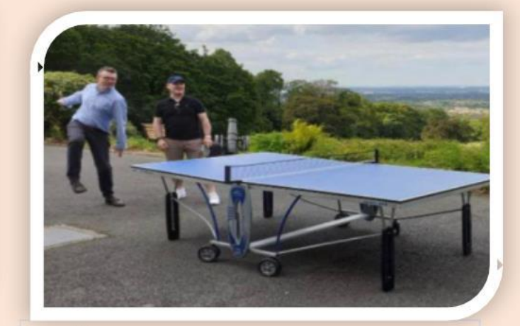
Table Tennis Bring out your competitive streak with a ping pong tournament!