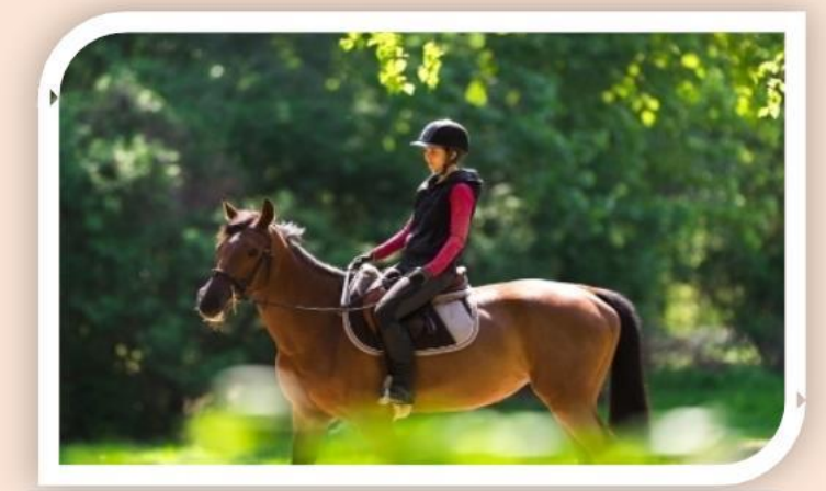
Horse-riding Truly unique experience with Equestrian School located beside Orlagh House who bring the horses to us !