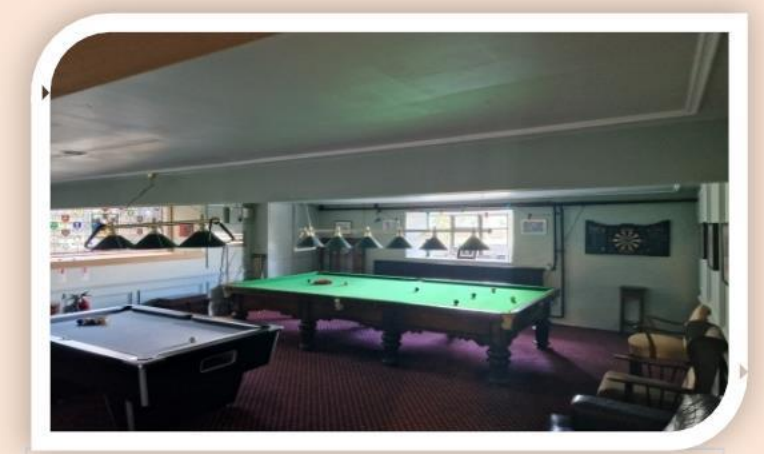
Games Room The perfect underground retreat with pool; snooker, darts I chess.