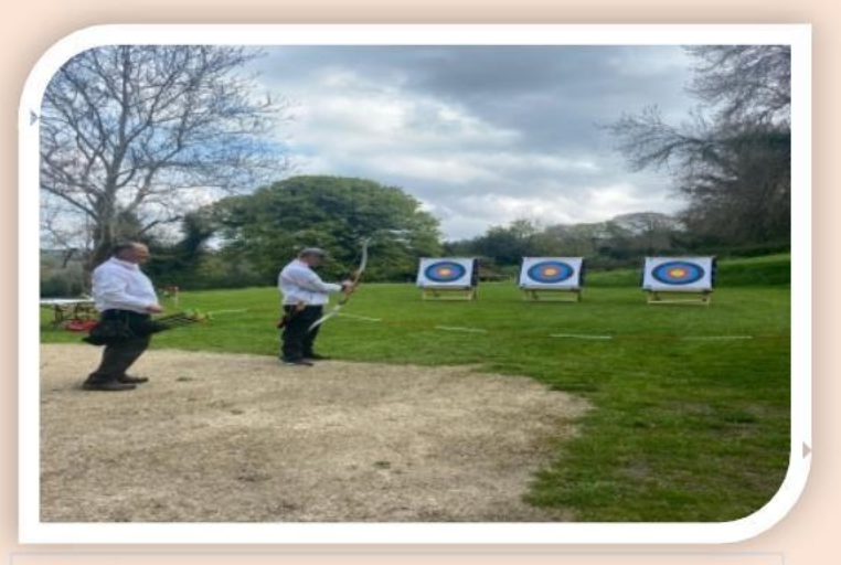
Archery Strike Gold in a Competitive test of skill and accuracy.